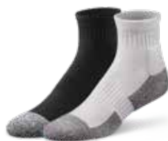
B | Ankle Length