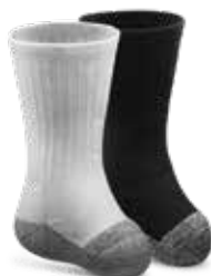
F | Transmet