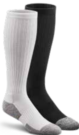
D | Over the Calf