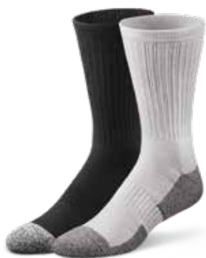
A | Crew Length