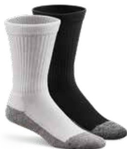
E | Extra Roomy