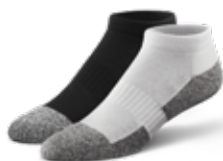
C | No Show